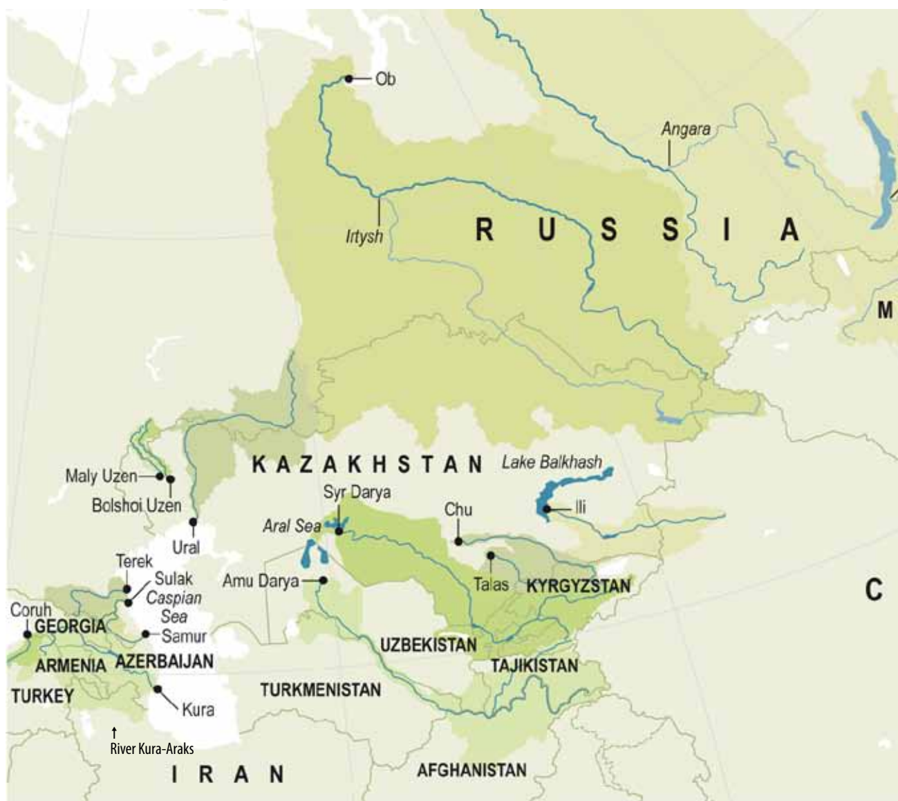
Transboundary waters in the Caucasus and Central Asia. Map produced by ZöE Environment Network, March 2011.

A preparatory mission took place in March 2010. The NPD kick-off meeting was held in December 2010, followed by the first Steering Committee meeting in April 2011. As a part of the NPD/IWRM in Turkmenistan, an expert group is planned to be established, which will assist Turkmenistan in the adoption of the standards of the UNECE Water Convention, including IWRM principles enshrined in the Convention, on cooperation in national and transboundary contexts and in the support of its accession to – and implementation of – the Convention. In 2011, a national workshop on IWRM is planned to be organized. The NPD/IWRM in Turkmenistan is supported by funds from the Norwegian Ministry of Foreign Affairs, the EC and the GIZ.