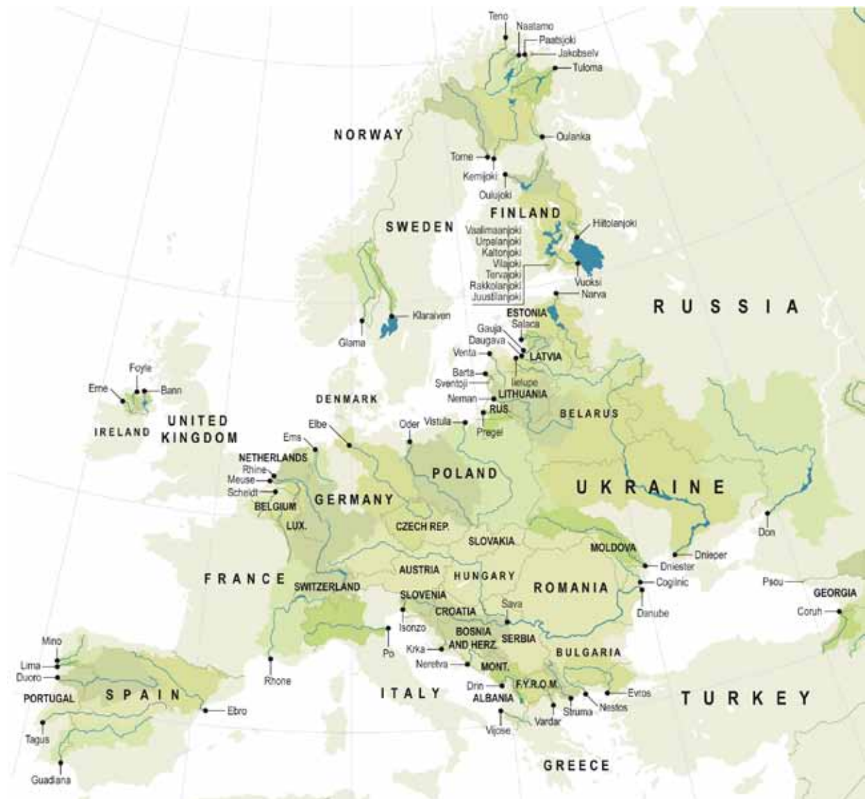
Transboundary waters in Europe. Map produced by ZOI Environment Network, March 2011.

The main focus of the NPD in the future would be the monitoring of implementation of the established targets under the Protocol on Water and Health. Discussions on possible funding from the Swiss Development Cooperation are ongoing. This work will be done in close coordination with the OECD within its NPD/WSS. The International Water Assessment Centre (IWAC) would be ready to also support NPD activities on transboundary water cooperation with Ukraine in the Prut River. These activities would be implemented under the EU Danube Strategy in close coordination with the Danube ICPDR Commission.