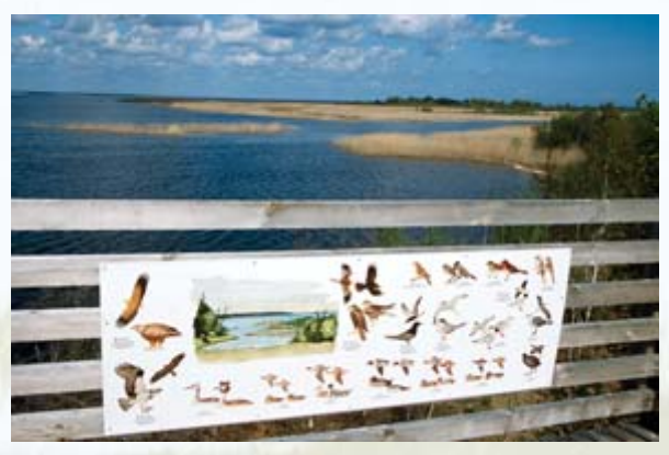
A view from the Pedaspää bird observation tower