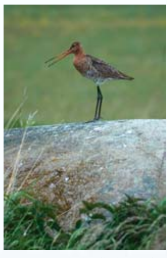
Black-tailed Godwit – Limosa limosa

Peipsi and its birds have changed a lot during the course of time. As many of the lakeside hayfields and pasture-lands are by now covered with brushwood a number of meadow Charadriiformes have disappeared or are currently disappearing among from hatching birds - Ruff, Black-tailed Godwit, Common Redshank. At the same time, reed and shrub-wood bird