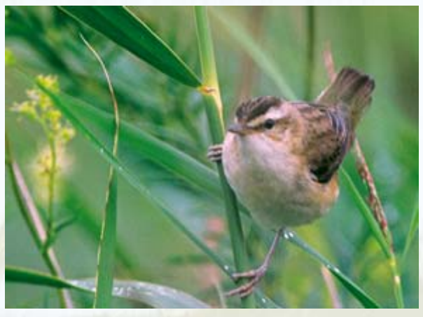
Sedge Warbler - Acrocephalus schoenobaenus

The shores of Lake Peipsi are often bordered by reed, the wider strips of this remain southwards from Varnja and also on the shorelines of Piirissaar island. Such areas appeal to Great Bitterns and Great Reed Warblers, whose populations at Peipsi are one of the most representational in Estonia. The reed thicket also hides the colonies of gulls, terns and Black Terns and the floating nests of Great Crested Grebes.