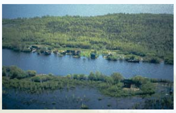
Peipsi shore at the mouth of the River Emajogi

ter area is called Lake Peipsi, the southern extension Lake Pskov and the narrow section, uniting the two parts, is Lake Lämmijärv. In the current publication, Lake Peipsi is conceived as all these parts together if not stressed otherwise.