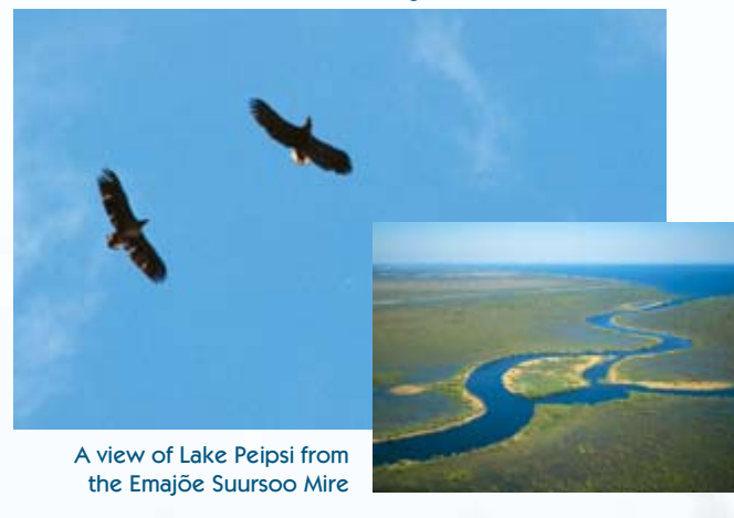
White-tailed Eagles - Haliaeetus albicilla

in Europe. About fifty eagles come fishing on the lake in this locality – half of them from Estonia and the others from Russia. From our side, it is mostly the White-tailed Eagles, which reach the fishing waters, whereas the majority of Ospreys proceed from Russia. The flying arches of Lesser Spotted Eagles and Golden Eagles – not so much linked to the lake – keep a little away from the shores, but it is fully possible to notice them on the local beaches.