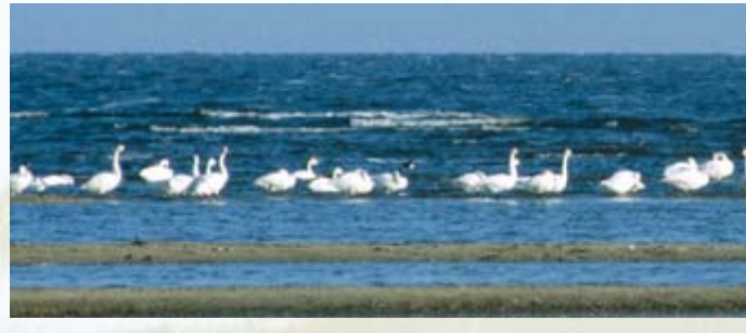
Tundra Swans - Cygnus columbianus

The demesnes of White-tailed Eagles and Ospreys in the lower course of the Suur-Emajõgi River and the shores of Lake Lämmijärv are among the most spectacular ones