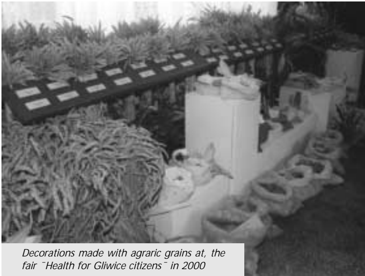
Decorations made with agrarian grains at the fair "Health for Gliwice citizens" in 2000

In 1998, with this aim in mind the Polish Ecological Club (PKE) initiated the Coalition to Support