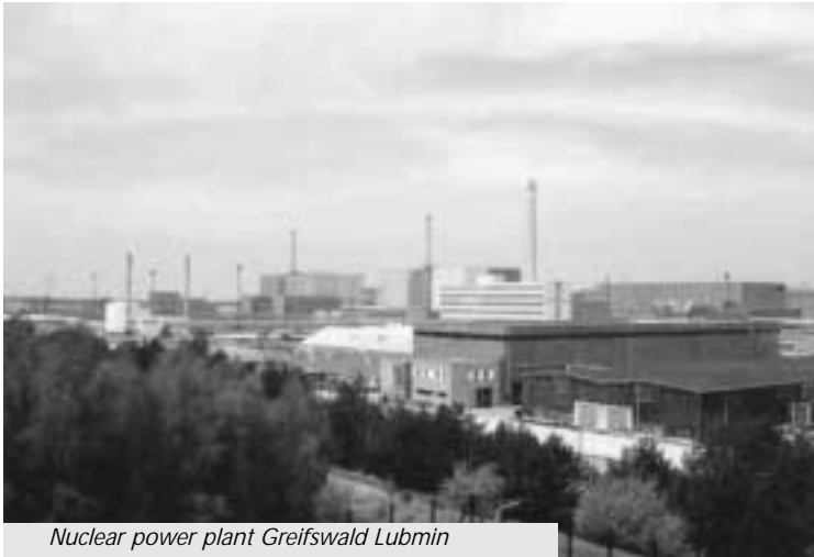
Nuclear power plant Greifswald Lubmin

The present situation is far from reaching this goal. At present, one of the biggest interim storage for nuclear waste in Europe and a plant for processing nuclear mud are located in the area of the former power plant. These facilities were projected to be used only for the waste of the old Greifswalder Bodden power plant, but the actual capacities reach considerably higher levels.