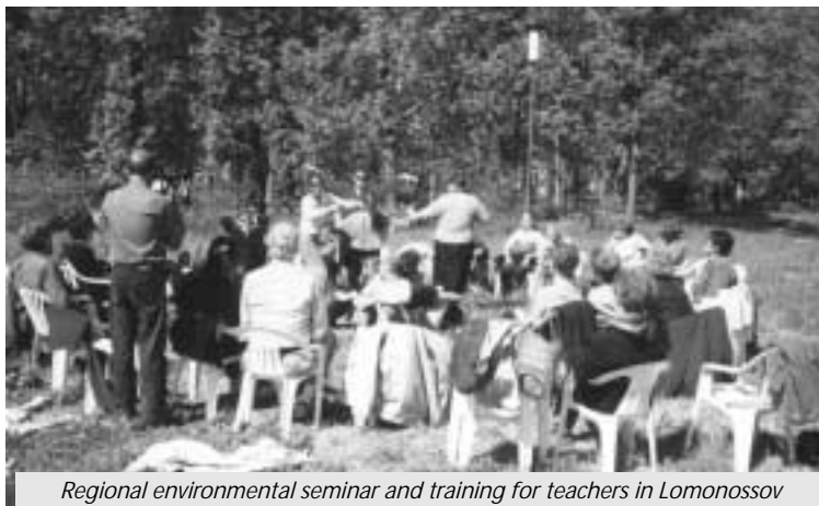
Regional environmental seminar and training for teachers in Lomonosov

This network joins teachers, schoolchildren, students and other residents of coastal areas around the Gulf of Finland in Saint Petersburg and Leningrad region. Four local information centers in Lomonosov, Kipen, Sosnovy Bor and Primorsk were equipped by the NGO Children of the Baltic with computers and free e-mail service to provide province teachers access to information and promote local and regional co-operation.