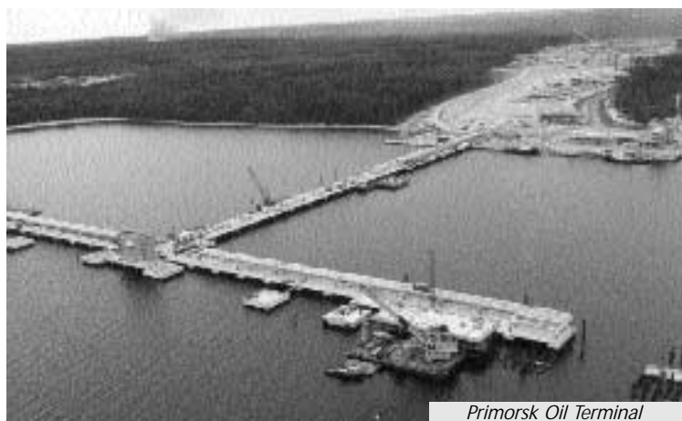
Primorsk Oil Terminal

As to the fish fauna, the area of Beryozovy Islands is considered to be one of the most favored spawning sites for important commercial fish species, namely for Baltic herring ( Clupea harengus membras ), white fish ( Coregonus lavaretus ), and sport fishing species such as perch, pikeperch and others.