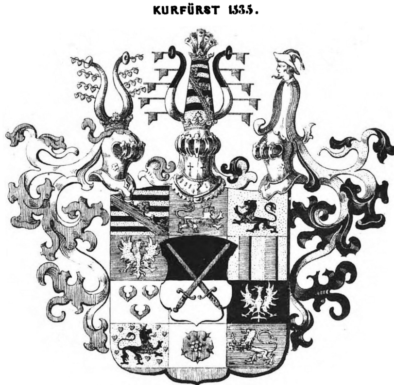
Fig. 6. The electoral coat of arms of Saxony in 1535, according to Johann Siebmacher (Hefner 1856, Pl. 27).

electoral lands and the electoral title; they were therefore able to use both the ducal and electoral coats of arms of Saxony. They also held the title of margrave of Meissen, and from 1482 onwards the title of landgrave of Thuringia (Bünz 2007, 42 ff.; Wellman 2011, 4 ff.). The first owners of the coat of arms could therefore have been the Ernestine princes of the Wettin dynasty. However, they lost the electoral title and most of their lands during the religious wars of the Reformation in 1547 and the title and the lands were taken by the Albertine line, who achieved them by siding with Emperor Charles V during the wars (Christensen 1992, 49, 72 ff.; Rudersdorf 2007, 90 ff.). The Albertine princes thus continued using the same charges on their coats of arms as the Ernestine princes.