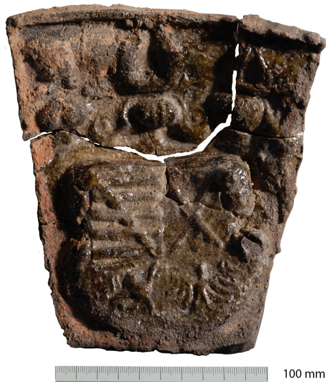
Fig. 2. Stove tile bearing the electoral coat of arms of Saxony found in Turku (Museum Centre of Turku, TMM22567:KA024:001).

An almost intact stove tile bearing a quartered coat of arms was found during archaeological surveillance work in Turku in 2009 (Fig. 2). The surveillance was carried out in an area between Linnankatu 1–3 and the Old Main Library, on the west side of the river. The stove tile was found in an excavation area just in front of the Old Main Library building, close to the present-day riverbank (Saloranta et al. 2009, 1 f.; Saloranta 2013) (Fig. 3). This area had been part of the Aninkainen Quarter, which was one of the four town districts in medieval and early modern Turku. According to written documents the wealthiest citizens lived initially either around the cathedral or the Old Great Market on the east side of the river, but after these areas became overpopulated in the 16th century, the plots in the Aninkainen Quarter began to be bought by wealthy burghers, nobility, members of the town council and various officials (Ranta 1975, 31–33, 161–166, 185–191; Kuujo 1981, 193 ff.; Nikula & Nikula 1987, 91 ff.).