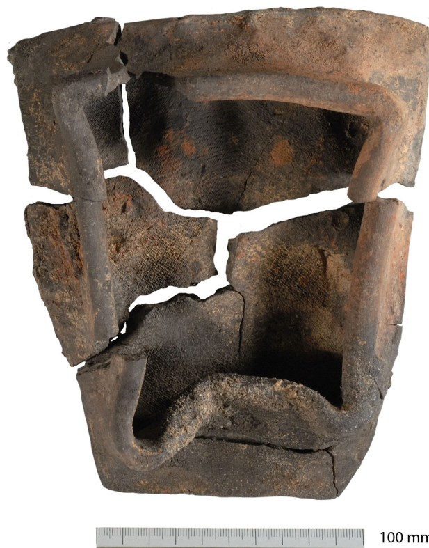
Fig. 4. The stove tile photographed from the back, showing the flange with a bend on it (Museum Centre of Turku, TMM22567:KA024:001).

The form of the stove tile is trapezoid, and it had belonged to a crest of a tile stove (e.g. Stephan 1991, Abb. 128–129, 108–110, 172). Its height is ca 16 cm and its width on the top is ca 15 cm and at the bottom ca 9 cm. It is made of redware and has a patchy green glaze, which has partly burned into bubbles, indicating that its manufacturing process was not wholly successful. Also the flange at the back of the tile, which facilitated its fastening on the stove wall, has a bend on it (Fig. 4). This could only have been caused by firing the tile at too high a temperature. Also its relief-decoration is relatively crude. On the basis of the colour of its glaze, the style of its decoration and the shape of its panel and flange, the stove tile dates to a period between the second quarter of the 16th century and the beginning of the 17th century, i.e. when Renaissance stove tiles were in fashion. Before these years the flanges had not fully developed into the form that is found at the back of the stove tile discussed here, and after these years the shape of the flange became bulkier. Also the glaze on later tiles is often dark brown or almost black and their relief-decoration is shallower (Majantie 2010, 70–79, 91–96; see also Franz 1969; Liebgott 1972).