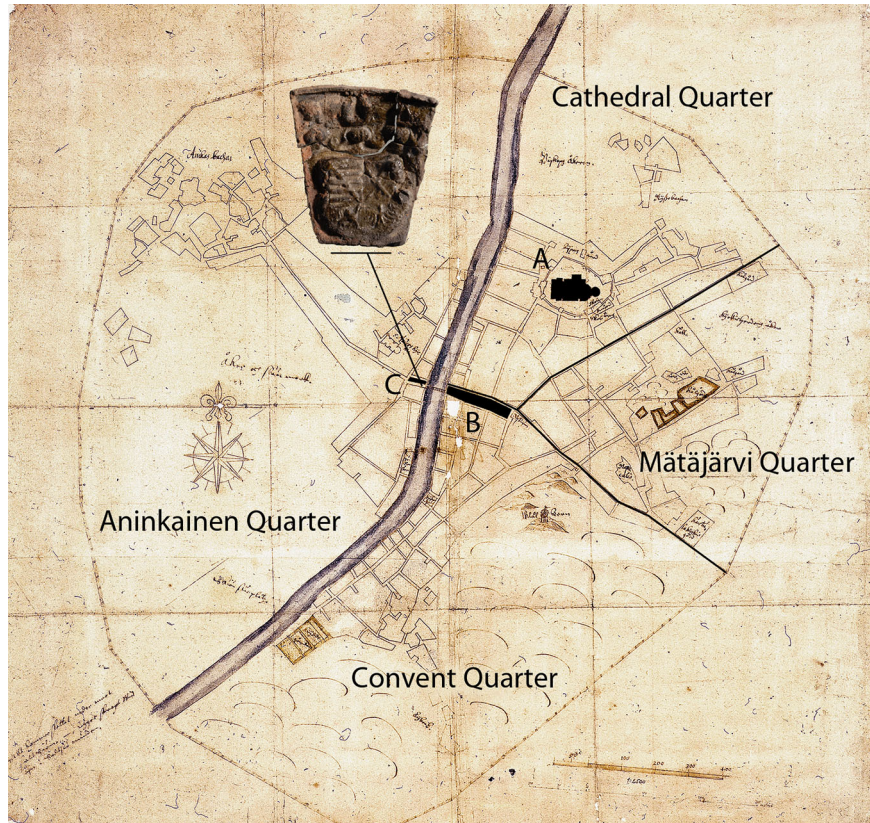
Fig. 3. The oldest map of Turku, drawn in 1634. The four medieval districts in Turku are marked on the map. Also the Cathedral (A), the Old Great Market (B), the Hauenkuono Square (C) and the place where the stove tile was discovered are marked on the map. The original map is kept in the archives of the National Land Survey of Finland. Map modified by Evangelos Daskalacos.

According to the excavation report the stove tile was found under a context which could be dated to the end of the 17th century (Saloranta et al. 2009, 2). No other fragments belonging to the same stove were discovered. The context where the stove tile itself was found could not be dated and since the excavation did not continue under this layer, the above-mentioned dating gives the latest possible date for the demolition of the stove. 1 Its actual date of manufacture can, however, be estimated more accurately on the basis of the style, shape and the coat of arms that it bears.