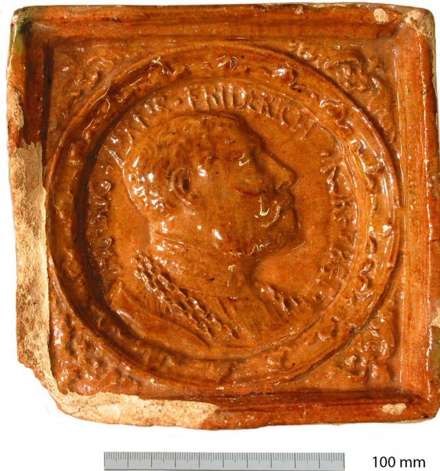
Fig. 7. Stove tile bearing a portrait of Johann Friedrich of Saxony found in Turku Castle (Museum Centre of Turku, TMM18434:1).

stove tiles (they bear a text Herzog Hans Friderich Korfvrst ), their archaeological find contexts suggest that they date to the 1560s; they had been located in a floor built during Duke Johan's time (1556–1563). This dating is also supported by the fact that Gustav Vasa described the castle as old-fashioned and uncomfortable in his letters in the 1550s; it is unlikely that he would have used these words if the highly decorated Renaissance tile stoves had been situated in the castle (for more details, see Gardberg 1959, 84, 224–226, 291–294). 6