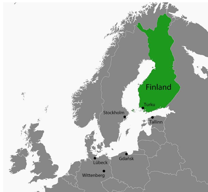
Fig. 1. The location of Turku and other towns mentioned in the article marked on a modern map of Europe. Map: Free Vector Maps 2014, modified by Evangelos Daskalacos.

The town of Turku (Åbo in Swedish), where the stove tile discussed in this article was found, is situated in south-west Finland, at the mouth of the Aurajoki River (Fig. 1). Only a few written documents have survived from the time of its birth, and none of them gives an exact date for its founding. According to recent archaeological excavations, Turku arose in the area next to the present-day cathedral at the beginning of the 14th century (Pihlman 2010, 12 ff.; Seppänen 2012, 940 f.). The Swedish Crown and Church were behind its founding and it became an administrative and ecclesiastical centre of the eastern part of the kingdom of Sweden. It was also an important centre for foreign trade; many foreign merchants and craftsmen, especially the Hanseatic merchants from the German lands, moved to Turku and played an important role in the formation of an organised urban society. They brought with them their own customs and technologies, and it was through them that many novelties of material culture reached the town (Kallioinen 2000, 5–9, 41 ff.; see also Gaimster 2014, 61 ff. regarding the commercial and cultural networks of Hanseatic merchants). The influence of the German merchants and artisans continued well into the 17th century (Ranta 1975, 161 ff.; Toropainen 2006, 126 ff.).