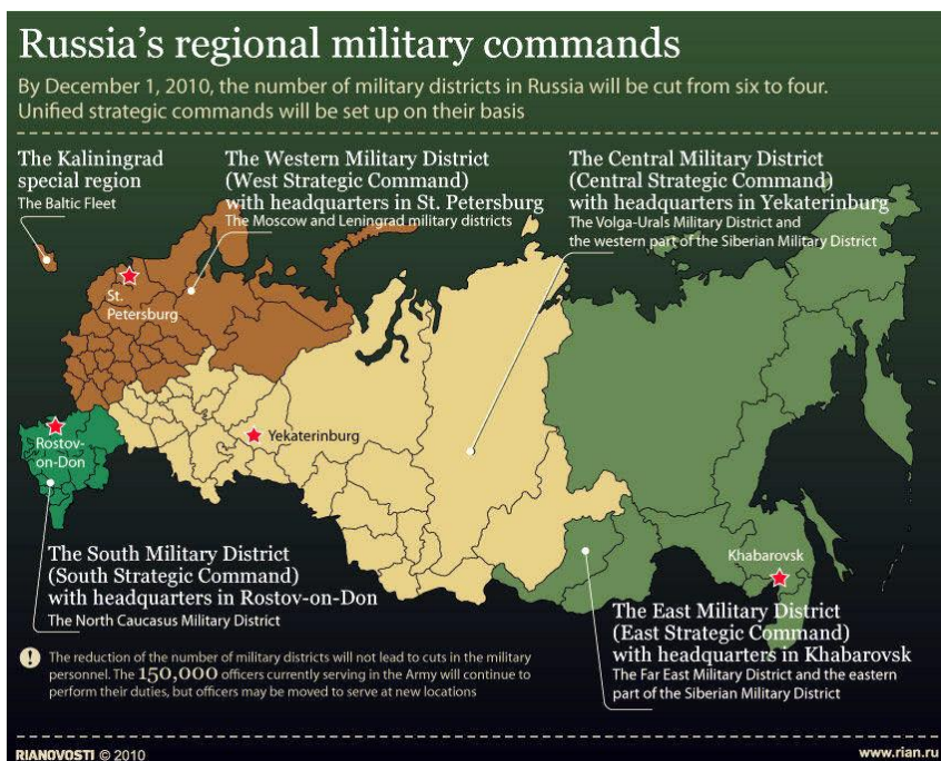
Picture Nr.1. Map of Russian Military districts 10

The new command system is organized in a three level system: “Operational Strategic Command – Army headquarters – brigade”. In this system the role of the brigade is to be the main operational-tactical unit. The reformers decided that the brigade would be a general, high profile, combat ready operational-tactical unit. To achieve this aim required the reorganization or complete disbanding of the reserve units. Then divisional and regimental level units were transformed into brigade level units.