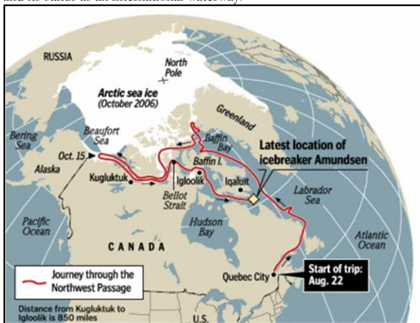
Fig. 3 Map of the (Canadian) Northwest Passage

2013. 42 It is a continuity of Canadian national policy as on July 9, 2007 Prime Minister Stephen Harper stated: “Canada has a choice when it comes to defending our sovereignty over the Arctic. We either use it or lose it. Make no mistake; this Government intends to use it. Because Canada’s Arctic is central to our national identity as a northern nation. It is part of our history. And it represents the tremendous potential of our future.” 43 The reference to „...national identity as a northern nation” sounds a bit like the Russian rhetoric about Arctic issue. It is speculated in the press that this claim is more about domestic politics than the possible raw materials in the seabed. 44 The new claim is expected to put Canada at odds not only with Russia, but possibly also with USA and Denmark, and the latter is supposed to have its own claim about the North Pole. Meanwhile, the USA worries more about the NSR and its status as an international waterway. 45