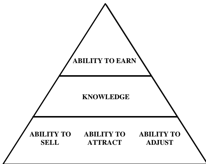
Figure 1. Hierarchy of national competitiveness (Trabold 1995, p. 182).

sees ability to earn (level of earnings) as the most general indicator of country's competitiveness, whereas ability to export, attractiveness (location) and ability to adjust are seen as factors. At the same time, in regard to (foreign) investment, ability to export and attractiveness function as sophisticated phenomena, that are independent indicators of competitiveness of a country. Their level and dynamics is determined by the wider complex of factors with complicated internal structure.