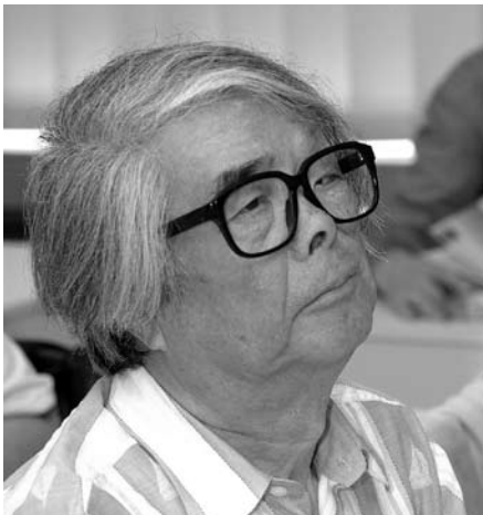
The Märchenakademie established by Toshio Ozawa in 1992 can today be found in over 50 cities throughout Japan.

Märchen-Stiftung Walter Kahn, Munich http://www.maerchen-stiftung.de/