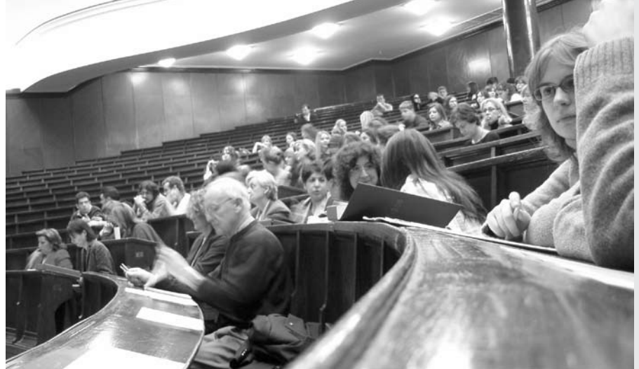
Getting ready for advances in oral literature research: glimpse of the conference venue and the audience before the start of a session.