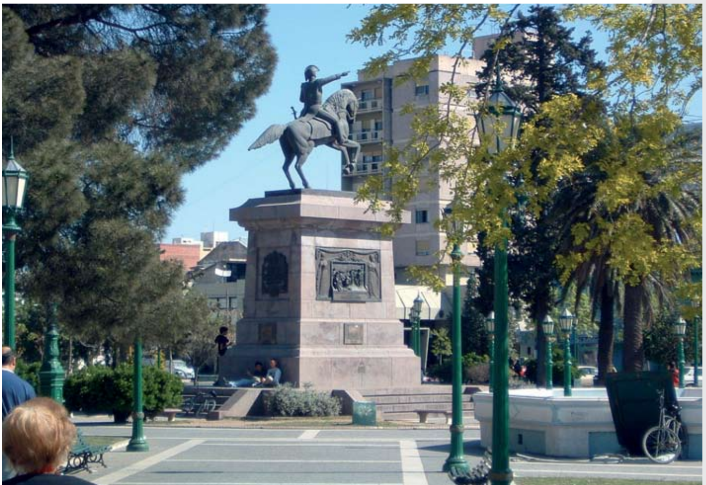
Plaza San Martín is the central square of Santa Rosa, La Pampa. The statue figures General José de San Martín (1778-1850), the national hero of Argentina and the first president of Peru.