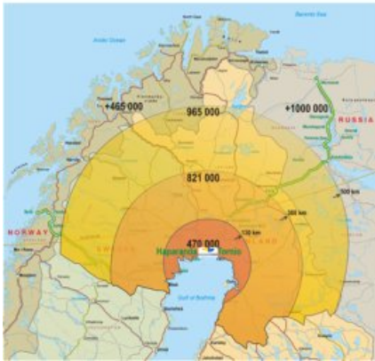
Bothnian Arc map

Although operating within a rather well-established setting and regime of European cross-border co-operation, the interest in projecting oneself as a twin city as well as the symmetries, competence, interests, problems and relevant infrastructures of the cities taking part vary considerably. They seem, in fact, to represent rather diverse patterns of co-operation. In some cases similarity is indeed present and the conceptual umbrella of twinning has really developed into an asset – as in the case of Tornio and Haparanda, two cities connected across the Finnish-Swedish border by a bridge. They are