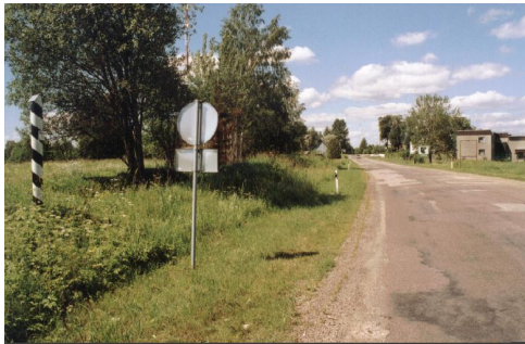
Border between Valga and Valka

The Estonian town of Valga (situated in Southern Estonia; 15.300 inhabitants) and the Latvian one of Valka (located in Northern Latvia; 7.100 inhabitants) joined the chain of twin cities in April 2005 through an agreement to launch a project called “Valga-Valka: One City – Two States”. The word ‘joining’ is justified in this context also because their cooperation with Tornio-Haparanda contributed to the usage and spreading