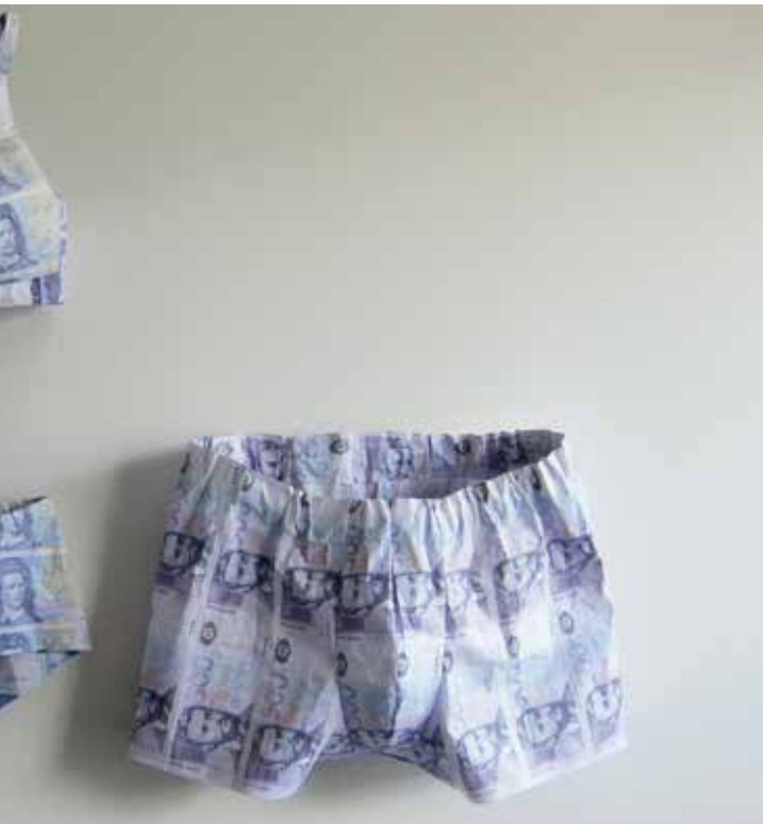
Krista Leesi. Money Laundering (Gender Equality) . 2010. Digital print, sewing. 80 x 100 x 13 cm.

are gathered, for example, in a certain chandelier that quietly fills with important and less important small items in suitable colours.