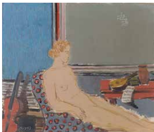
Music . 1943. Oil, plywood. 35 x 41.5 cm. Private collection, Estonia

exhibitions took place. However, except for the painting showing lively partying by Pallas artists, in Kõks's café pictures the passionate human relationships of the intelligentsia of the time are replaced by colour relations in interior details or tense dialogues between the patterns of the ladies' costumes and the café's curtain fabrics. If any human contacts are depicted in these generally strikingly autistic café situations, they are invariably reduced to, for example, a picture in a mirror, or they are clearly less significant than communication between objects. For instance, there is a view of a locale with dancing people, where, regardless of the bodily closeness of couples, the most striking relationship is going on between three