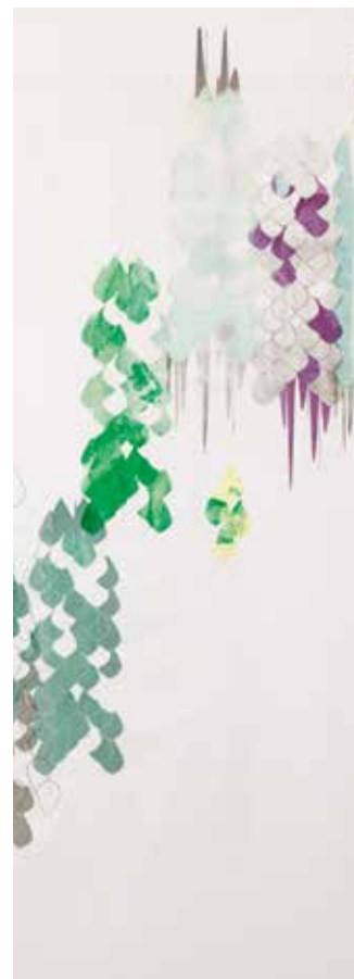
Kärt Ojavee. Photosynth . 2012