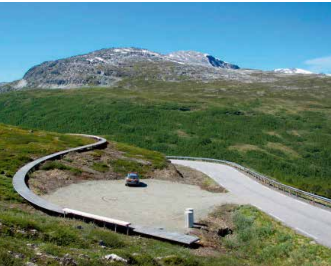
Vedahaugane at Aurlandsfjellet by LJB AS