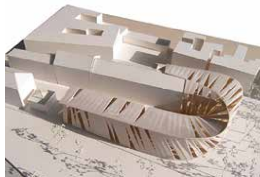
Art Plaza . Project: New Estonian Academy of Arts building. SEA & EFFEKT Architectural Bureau (DN)

The time will come when people wake up from the 'hangover' of EU grants. Maybe that will occur during the next EU budgetary period, and various bitter truths will be revealed, for example that the backlog in road construction has led to a situation where smaller and side roads are useless. Or it will become clear that the result of constantly ignoring art education is that no more young musicians and artists will graduate from Estonian universities, whether or not, and to what extent, the current decision-makers actually care.