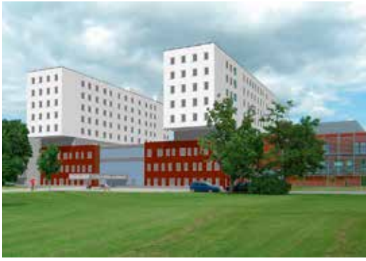
Casa Nova. Extension of the Tartu University Hospital. OÜ AW2 Arhitektid and OÜ ConArte. The project is partially financed from the European Regional Development Fund (no of project CCI 2012EE161PR001)