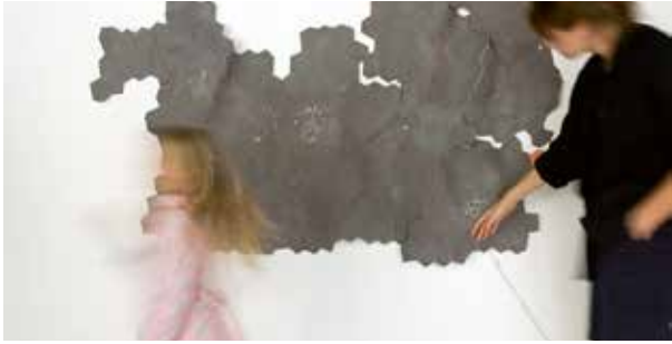
Kärt Ojavee. Symbiosis W . 2012

Entering one of the exhibitions and the world of Kärt's Undefined Useful Objects (UUO) means leaving a highly time-regulated and noisy city environment and entering a quiet and peaceful sphere. The quiet/low dynamics of the art objects calm the exhibition visitor in the same way as he would experience somewhere in nature. The beholder is immediately included in the space spanned by the artist, dynamic and interactive nature-mimicking UUOs and himself. The exploration can start.