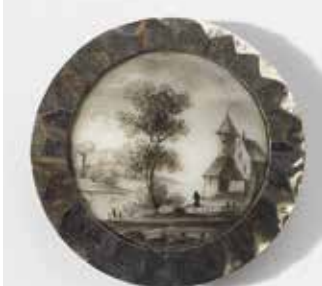
Death. 1666. Narva Museum

Here we are once again faced with the context of the exhibition, the space in Niguliste Museum. It is white, grand, tranquil and spacious, the Nordic gothic, equally simple and full of light. The light floating around in the church and the empty pews seem to encourage people to ponder, at the end of the exhibition, what death should actually tell the living. I offer one possibility: ' memento mori! ' is not the opposite of another famous slogan: ' carpe diem! ' Quite to the contrary, one supplements the other. Amongst other things, the exhibition displays probably one of the very few items that survived the totally bombed out old town of Narva, from the local German church. It is a mechanical clock figure from 1666 depicting death. Its movement can be understood in two ways: death certainly appears, although it then slides past. These two motifs are like two sides of the same coin. Thus one possible view of the Art of Dying , strangely enough, suggests the exact opposite of the title of the exhibition. It can be seen as a wish to live your life so that at the moment of death you can appreciate a life lived well.