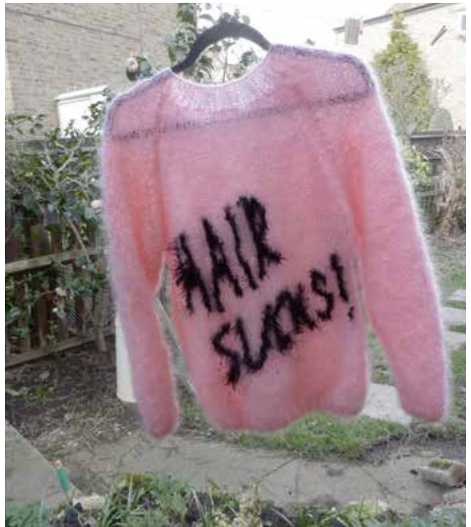
Jaanus Samma. T02.1 'Hair Sucks' . 2012. Mohair. Knitter: Mare Tralla. Ca 60 x 60 cm.

There is an increasing number of things around us and collecting partly fulfils the function of recycling, working against excessive production. On the other hand, the passion for collecting requires more and more things, and collecting old things is after all just another form of consumption.