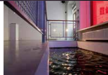
Neeme Klm. Shimmer On The Surface . 2012. Installation. Exhibition view: Shimmer On The Surface at Hobusepea Gallery, Tallinn.