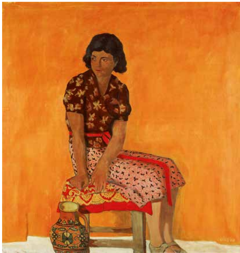
Gipsy Girl Astra . 1940. Oil, canvas. 104.5 x 109.6 cm. Art Museum of Estonia

The majority of Kõks's Tartu period work, produced during the Soviet and German occupations, is made up of studio and home pictures, with women, either vainly dressed or being nude; there are also still lifes, urban views and of course café scenes. In the context of Estonian art, Kõks indeed produced a remarkable number of café pictures; the earliest are amazingly modern considering the tranquil mainstream of the Pallas school in the late 1930s. Even in 1943, when he was dispatched in an official capacity to German and Austrian labour service camps, which incidentally was his only trip abroad from Estonia, he returned with idyllic pictures of cafés and leisure activities. Also quite a long section in the article mentioned above was devoted to the special atmosphere of cafés, and their importance as centres of intellectual life in Tartu, where essential conversations, exchanges of information, disputes and even