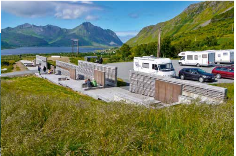
Torvdalshalsen at Lofoten Islands by 70°N Arkitektur

roads to their final design, including various environmental issues (e.g the collecting and purification of water, and muffling noise), but also social and cultural aspects (e.g visual contact between villages and smooth pedestrian connections, and historical landmarks). The main purpose of the Highways Agency in England, for example, is to minimise the damaging effect of the road network on the landscape; it can also be defined as road construction that supports landscape. As much as possible, the Agency takes into consideration the qualities of landscape, especially in ‘remarkably beautiful areas’, carefully examines the landscape forms and structures of settlements before selecting the route of a road, designs the roads so that they do not block the views of settlements and so that they preserve significant landmarks, emphasise the typical features of cultural landscapes, protect wild nature, etc. And when we look at the pictorial examples added to the instructions, we can clearly see that it is possible to make motorways diverse and attractive. It is interesting to note here that the fastest and safest road is not straight and horizontal, but smoothly winding and following the relief, i.e a road that keeps the senses alert and forces the driver to take notice of the surroundings.