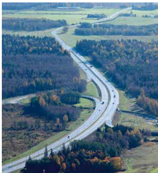
The most important junction in central Estonia - the Mäo detour.

Much could happen while travelling along roads. People could get hopelessly lost, they could encounter crooks and robbers, and also face supernatural strangers. The excitement, anxiety and fear expressed in many tales can be linked to the emotions experienced by a traveller of long ago who was out and about late in the evening or at night, whose spirit was ready for anything unexpected. The traveller knew he had abandoned the secure home territory and was moving through an alien one. This ambiguous state placed him between the earthly and supernatural reality, and he could count himself lucky if he reached his destination without wandering into a mysterious space revealed in the ghostly darkness of the night. A door into this kind of mystical world opens up the genre of legends; a few examples have been given in the current article. For today's Estonians, the door is basically closed, as a few examples of such tales are unable to bring to life all the images and encourage associations hidden in old texts. After all, these possible associations and images have largely been forgotten, and the paths of religious thinking are overgrown. However, anyone interested enough to explore can find a fascinating world, where the roads walked in reality lead us into supernatural places and then return us to our earthly reality.