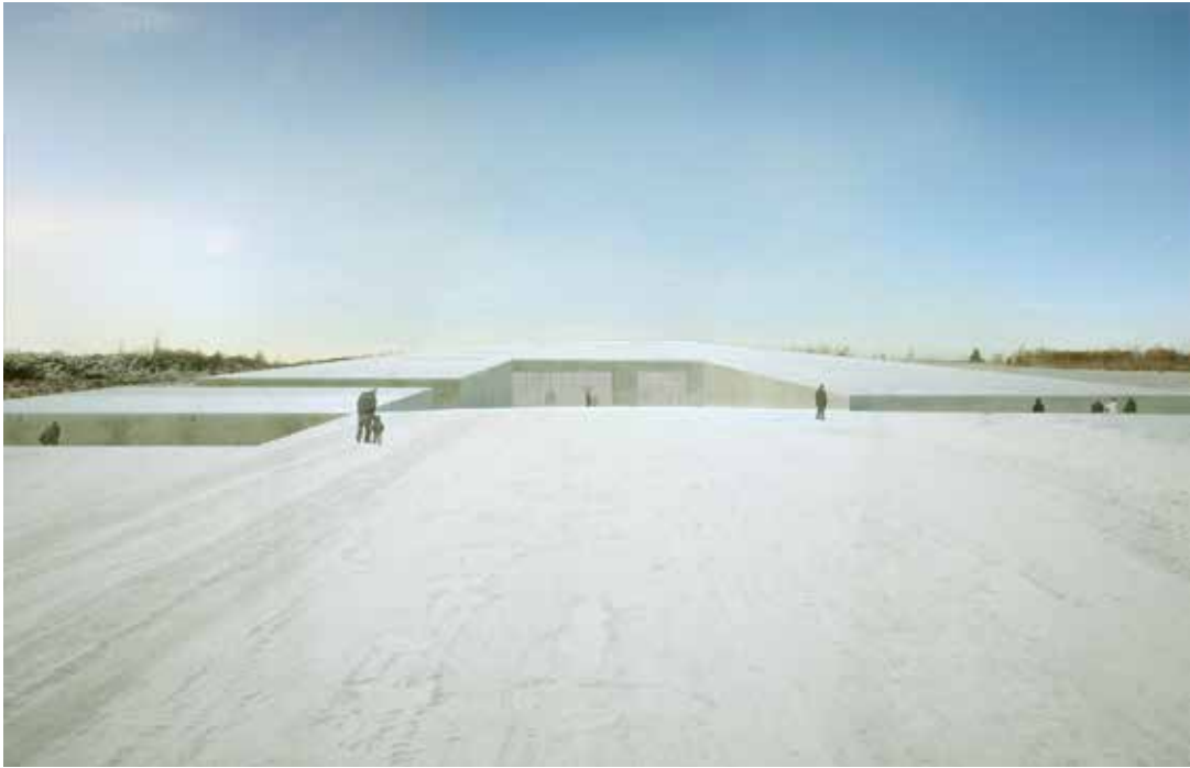
Memory Field. New building of the Estonian National Museum. SARL D'Architecture Dorell Ghotmeh Tane Architectural Bureau. To be completed in 2016.

in concrete and more in people. There is no point in casting mistakes into stone, leaving them in real space for a long time and making fun of the ruler. Architecture resembles the humanities: it cannot really be measured or pigeonholed; it is subjective and thus relatively uncontrollable, something to be avoided rather than desired. Architecture leads to extra costs, both time-wise and financially, and this does not fit into the silk-thin agenda of today's government.