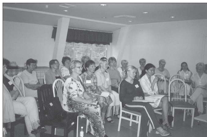
Seminar at Kloogaranna

Concurrently, the Political Parties Women's Associations Roundtable that meets in Tallinn had the idea of forming an umbrella organisation consisting of registered non-profit status political parties' women's divisions, initially. Later they invited women's