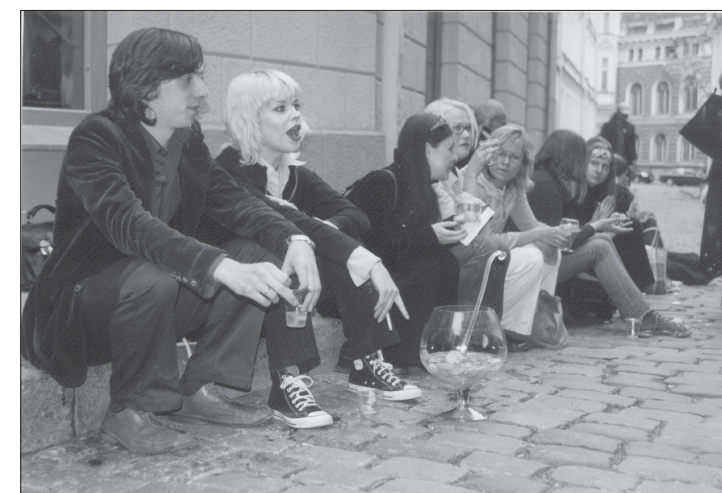
Visitors at the book presentation

"What do women want?" is a collaborative project involving organisations whose interests include feminism and gender equality: Equality Youth Association in Estonia, Estonian Women's Studies and Resource Centre, Pure Joy, Gender Park, Young