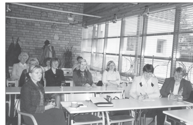
Seminar at Haapsalu

treatment", what difference does de jure and de facto equality have, what do "direct" and "indirect discrimination" mean, how is "harassment" defined in the law, and so on.