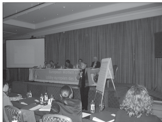
General Assembly of European Women's Lobby at Brussels

women's organisations in different countries, the bill was not tabled by European Parliament. Many recommendations were made in the workshop on how EWL members could continue to work on the proposed directive. Besides applying pressure on own governments and members of parliament, it was suggested that members explain it to interest groups, such as insurance companies and media organisations.